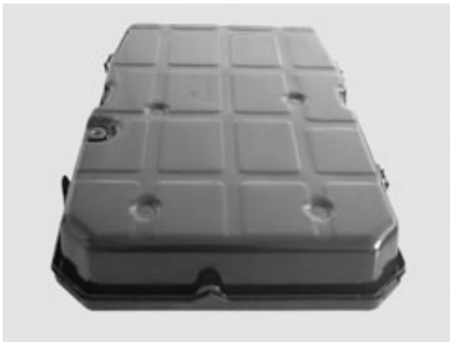
Figure 1. Oil pan (with round forms) transmissions 722.9 up to production date June 21, 2010 P00-40-2027-01