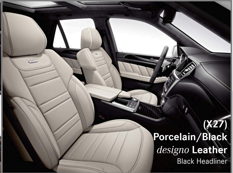
(X27) Porcelain/Black designo Leather Black Headliner