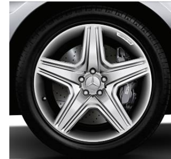
20in. AMG 5-Spoke Wheel (778)