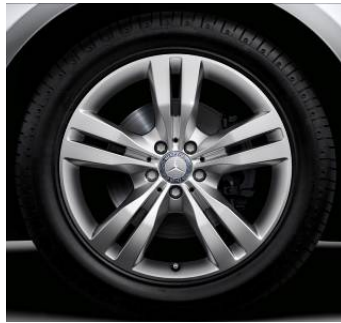
19in. Twin 5-Spoke Wheel (R55)