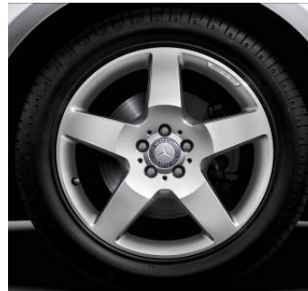
19in. AMG 5-Spoke Wheel (780)