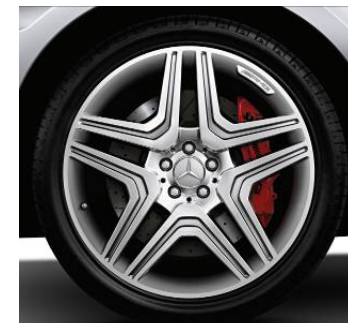
21in. AMG Twin 5-Spoke Wheel (798)