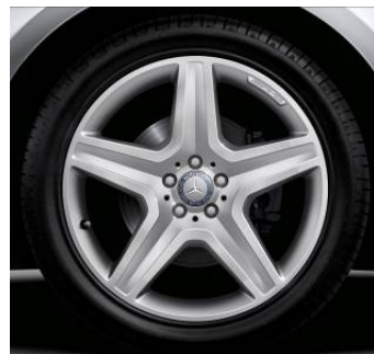
20in. AMG 5-Spoke Wheel (758)