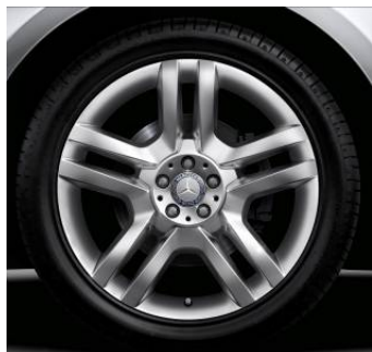
20in. Twin 5-Spoke Wheel (R33)