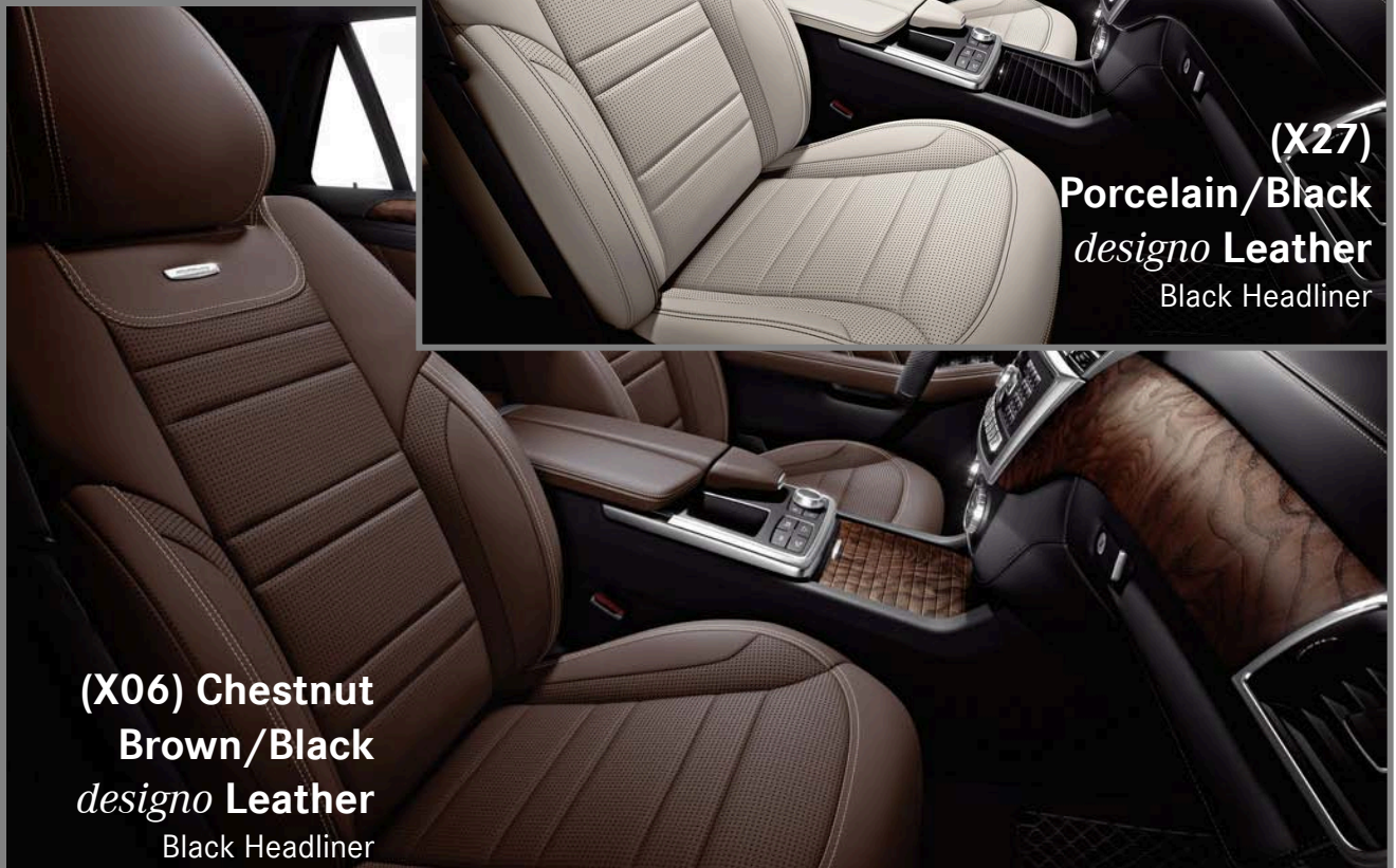
(X06) Chestnut Brown/Black designo Leather Black Headliner