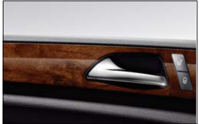
(731) Burl Walnut Wood