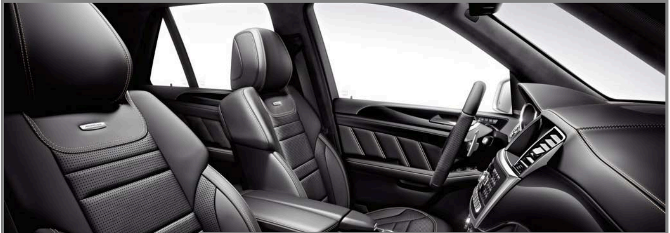
(X11) Black/Black designo Leather Black Headliner