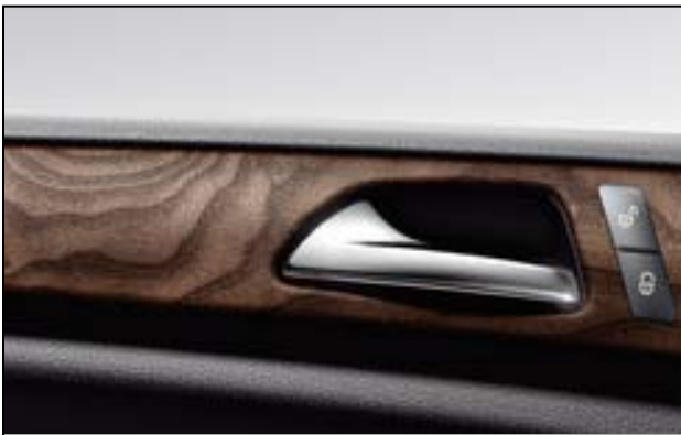
(H09) Brown Ash Wood (Open-Pore)