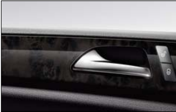
(729) Anthracite Poplar Wood