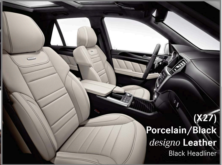
(X27) Porcelain/Black designo Leather Black Headliner