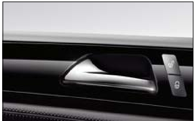
(W69) designo Piano Black Lacquer Wood