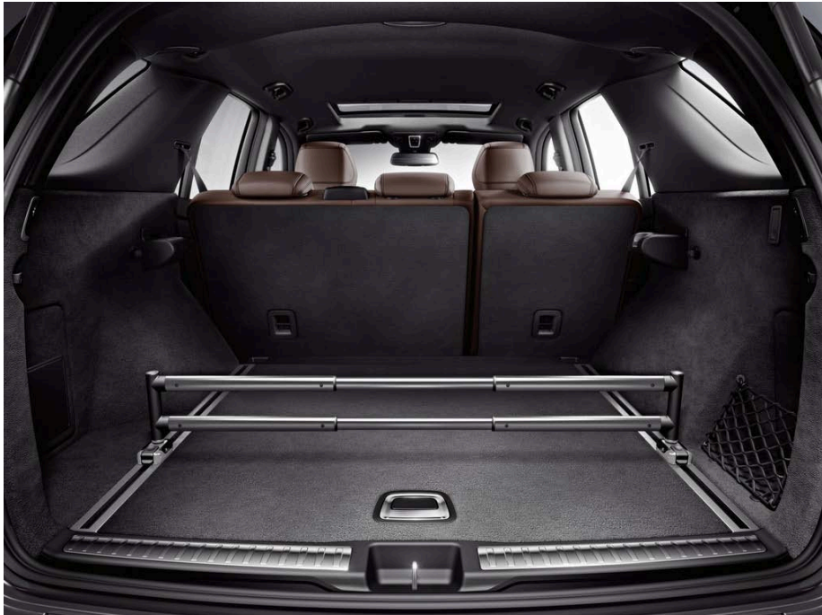
EASY-PACK Load Securing Kit shown with included load securing rails and telescoping bars.