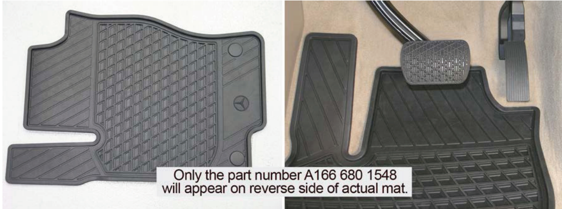
Figure 1 (Part number: A16668010487J07 or A16668010489051)