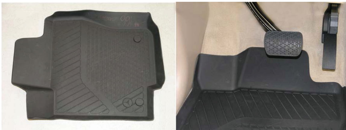
Figure 2 (Part number: BQ6680719 or BQ6680720)