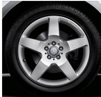
19in. AMG 5-Spoke Wheel (780)