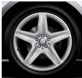
20in. AMG 5-Spoke Wheel (758)