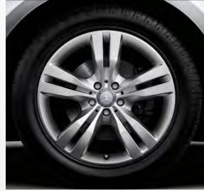
19in. Twin 5-Spoke Wheel (R55)