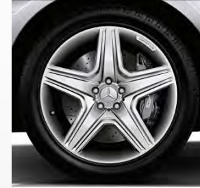
20in. AMG 5-Spoke Wheel (778)