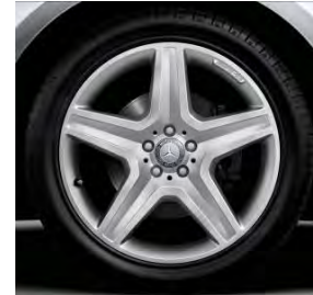
20in. AMG 5-Spoke Wheel (758)