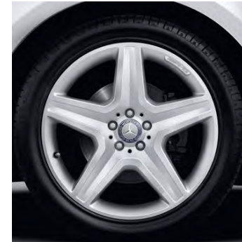
758 – 20" 5-spoke wheel