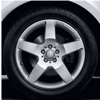
780 – 19" 5-spoke wheel