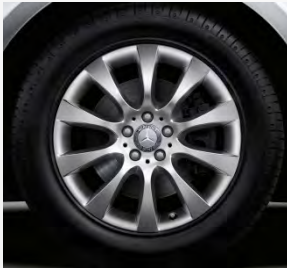
18in. 10-Spoke Wheel (R41)