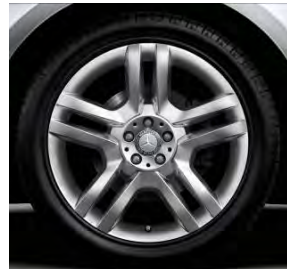
20in. Twin 5-Spoke Wheel (R33)