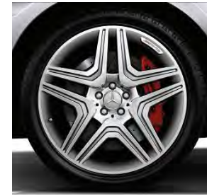
21in. AMG Twin 5-Spoke Wheel (798)