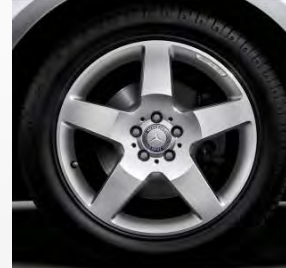
19in. AMG 5-Spoke Wheel (780)