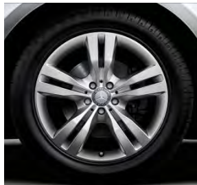
19in. Twin 5-Spoke Wheel (R55)