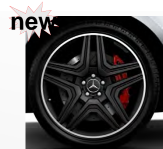
21in. AMG Black Twin 5-Spoke Wheel (685)