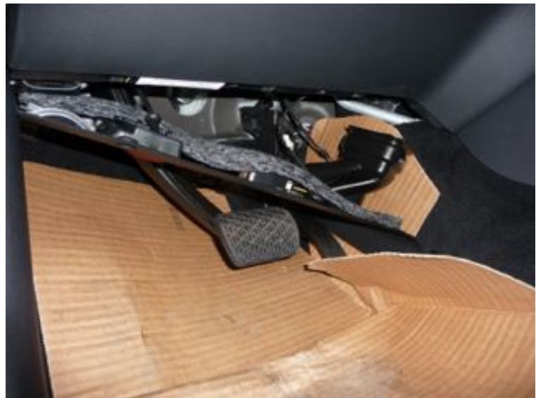
Lower panel and move vent