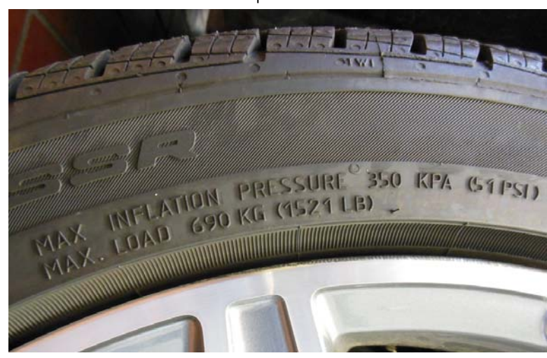
Tire pressure label located on the tire. Maximum tire pressure value for this particular tire.

Tire pressure label located on the right side of the driver door jamb. Shows <u>maximum</u> tire pressure values for this model vehicle.