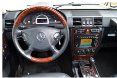
2005 Mercedes- $45,888 87,332 miles