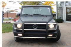
2005 Mercedes- $48,495 92,832 miles