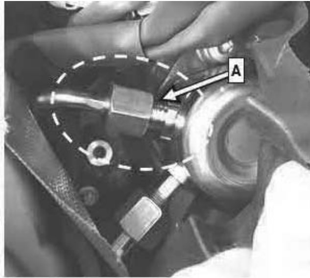
Figure 3, OK View of left