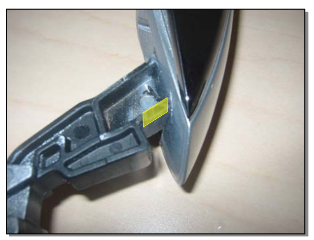
Figure 2 - Front rib beveled 45°