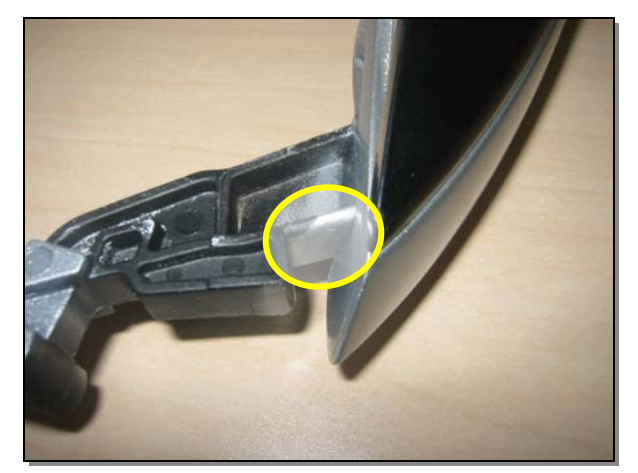
Figure 1 - Bevel the front rib