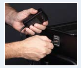
Rechargeable battery provides power for a full day of use.