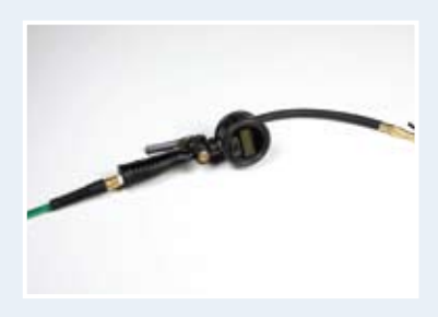
Fill gun features illuminated digital display, superb accuracy, and durable rubber-coated housing.