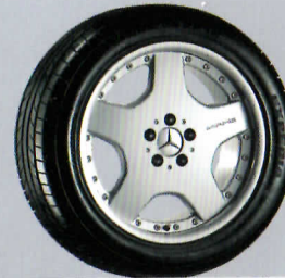
18 STYLE I