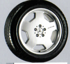
18 STYLE II

High-sheen rim flange; modification of bodywork necessary