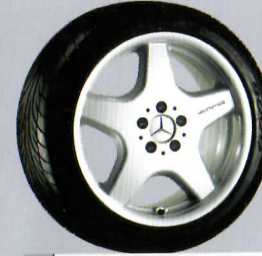
18 STYLE I

High-sheen rim flange; for models through 06/98 only; modification of bodywork necessary