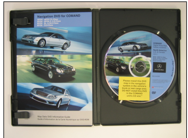
Figure 4 New Version 2005.3 DVD