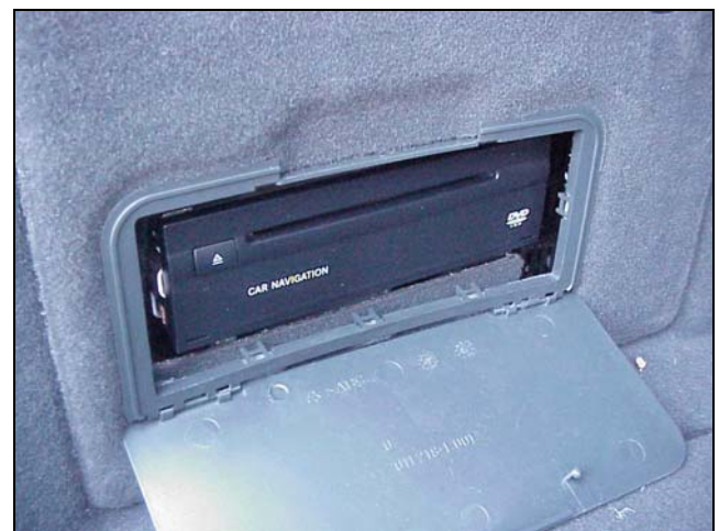
Figure 5 Insert DVD into Car Navigation Disk Drive