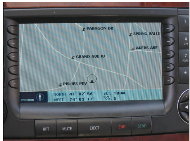
Figure 7 COMAND Display after position is reacquired