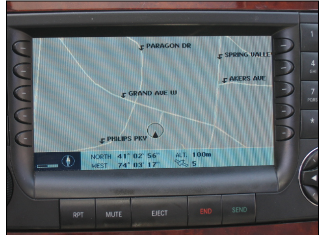
Figure 1 COMAND Display after pressing MAP key