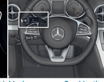
Combination switch - windshield wiper