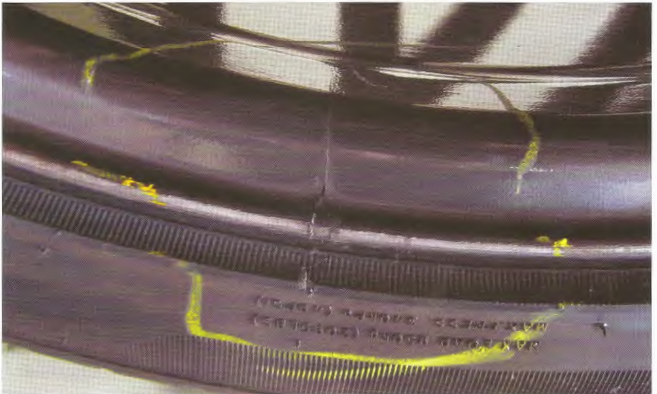
This GL450 has a damaged aftermarket wheel from hitting a pothole. There was not enough sidewall to absorb the impact. Also, this rim's construction is inferior with too much offset